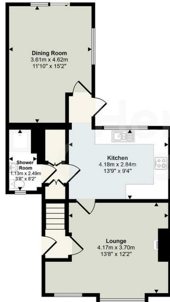
Ground Floor Approx 56 sq m / 605 sq ft